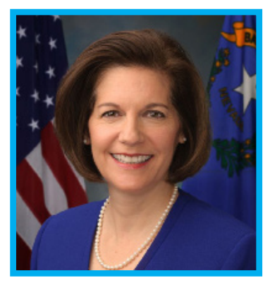
Catherine Cortes Masto Senator of Nevada